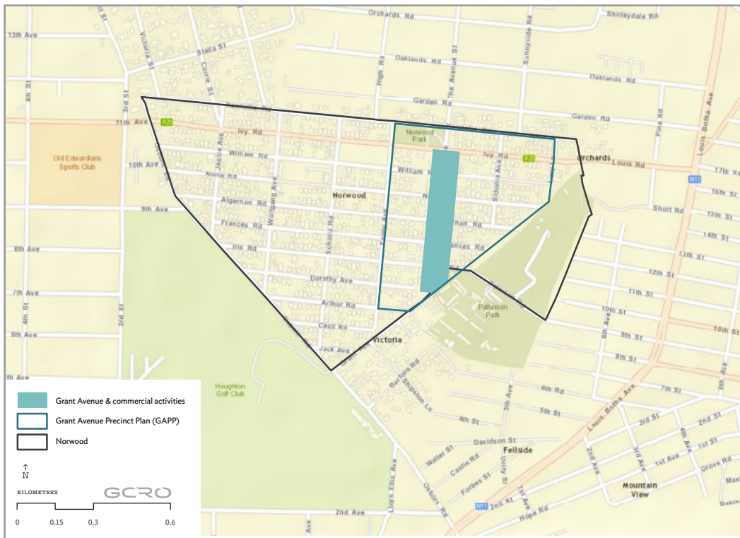
Figure 3: Location of the Grant Avenue Precinct. Map drawn by Samy Katumba