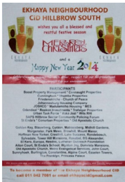
Figure 9: Safe New Year's Eve campaign poster displayed inside a residential building in the Ekhaya RCID.

The role building managers play in disseminating norms throughout the neighbourhood and institutionalising visions and practices is evident in the preparation and planning of social events for the neighbourhood's children – Ekhaya Kidz' Day and the Ekhaya Street Soccer tournaments. These events are organised by the Ekhaya coordinator, but because the housing managers live in the buildings they govern and are familiar with their tenants, they organise the participants from each building and are entrusted with the children's safety. These activities help to realise the vision of Hillbrow as a safe, stable, family-friendly neighbourhood.