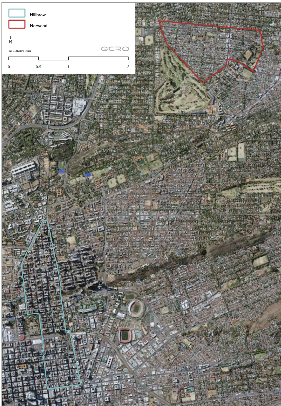
Figure 1: Location of Hillbrow and Norwood.