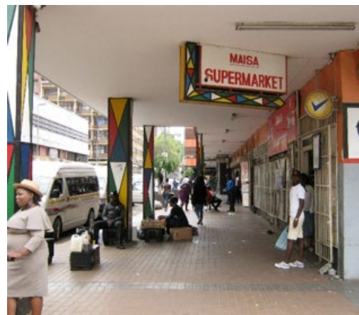
Figure 10: Informal traders in the Ekhaya RCID. Informal, unlicensed pavement trading contravenes City by-laws and is not tolerated by the JMPD. It is, nevertheless, very much present in the immediate environs of Ekhaya member buildings, suggesting that a mutually beneficial relationship exists between traders and some building managers within the Ekhaya precinct. The top two photographs show the same entrance to an Ekhaya member building: the top left photograph shows the entrance during the day, the top right photograph, at night.