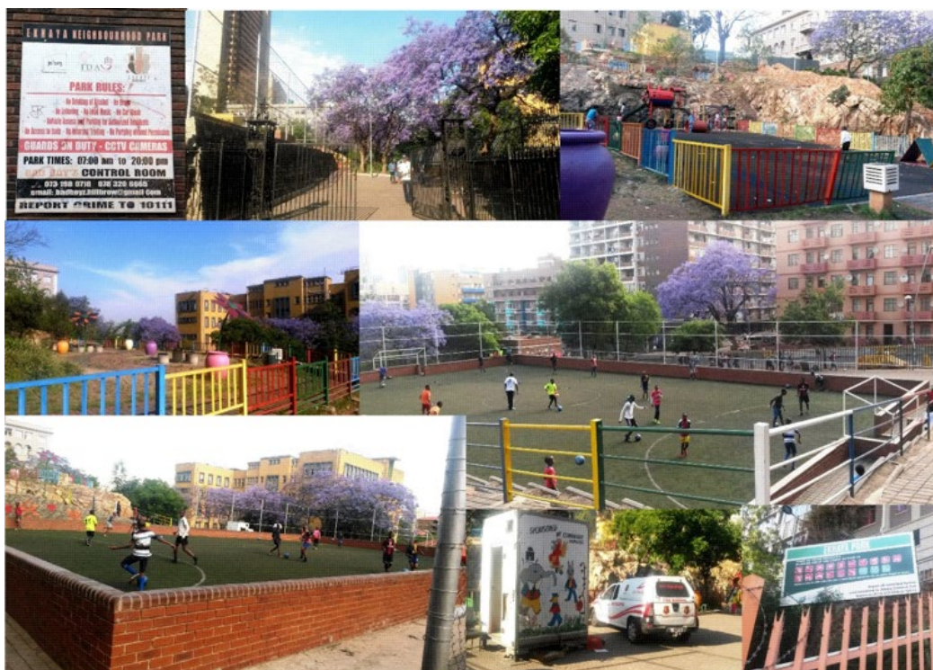
Figure 6: The amenities, recreation activities and management partnerships of Ekhaya Park.