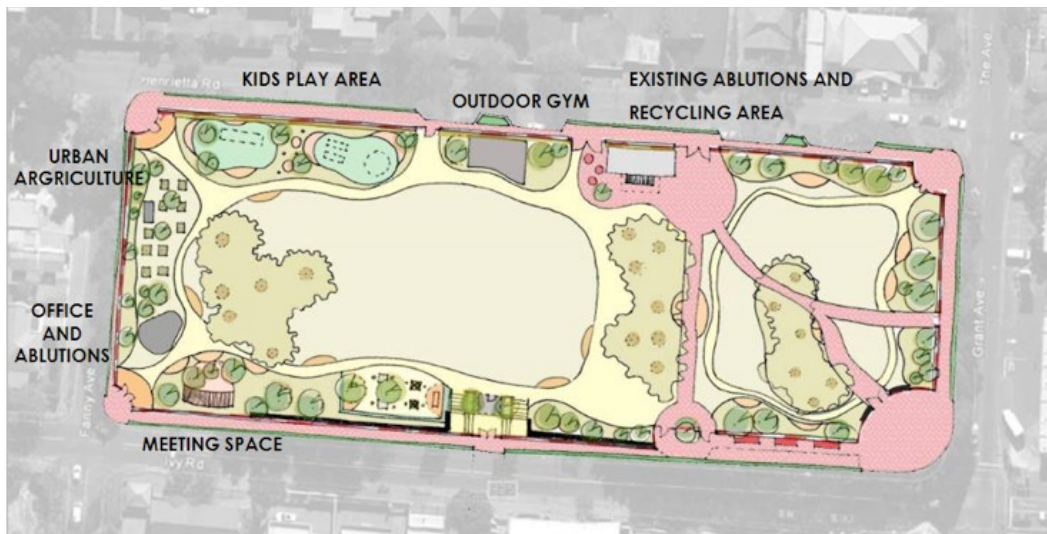
Figure 8: Initial design for upgraded Norwood Park. An architect's rendering of the initial design for upgrading Norwood Park, including a play area, spaces for urban agriculture and ablution facilities.