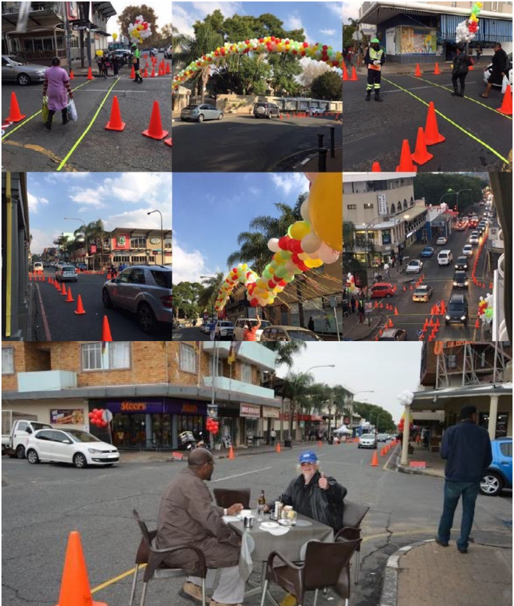
Figure 5: Objects and materials used to test planning and design concepts in Norwood.